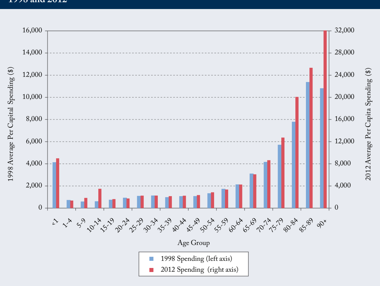
Figure 3: Average Per Capita Health Spending by Age Group in Prince Edward Island, 1998 and 2012

Note: The vertical axes show nominal dollars for transparency's sake: these are the actual dollar figures from CIHI. We could have used constant dollars from either – or, indeed, any year – or index numbers, because this focus of this figure is the relative distribution of health spending by age in the two years. To facilitate comparison of the age-profiles of spending: we have set the vertical scales so roughly half the bars in each year are taller (or shorter) than their counterparts in the other. Source: CIHI (2014).