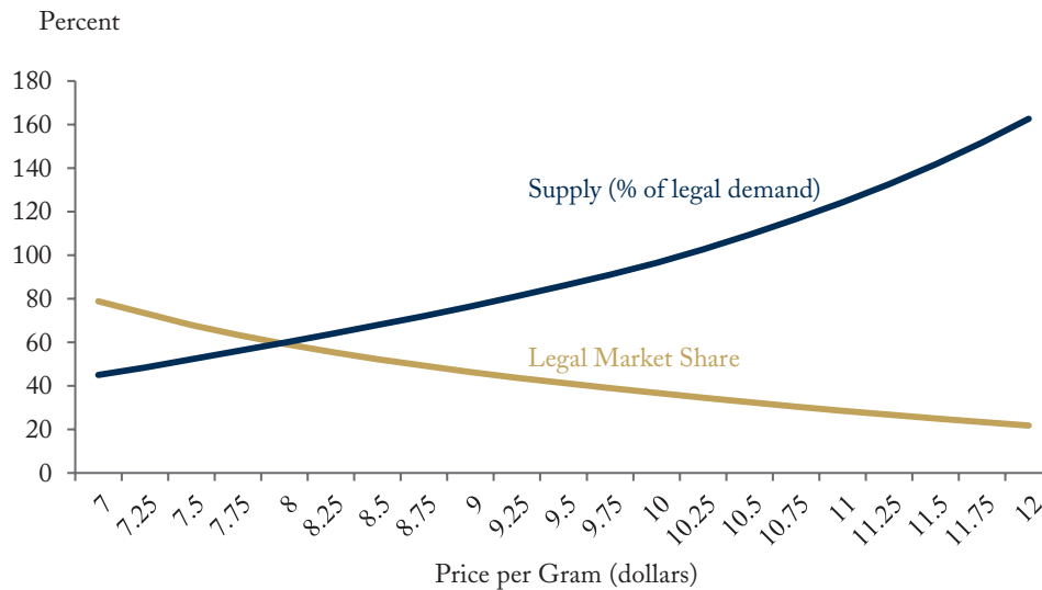
Figure 2: Legal Marijuana Market