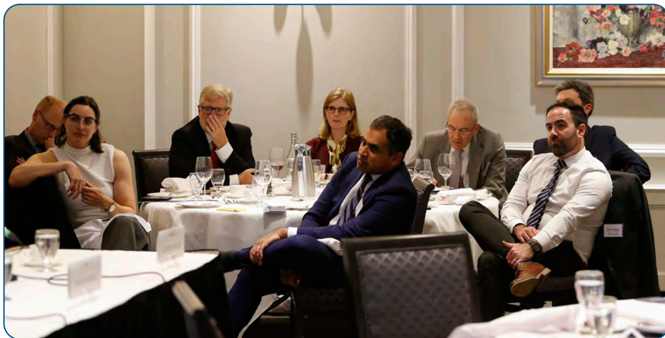
Patrons' Circle Event: Inflation: The Threat and the Response