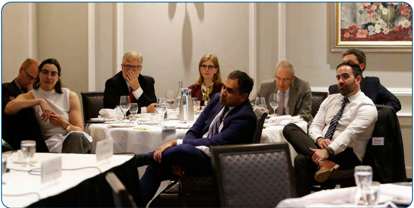
Patrons' Circle Event: Inflation: The Threat and the Response