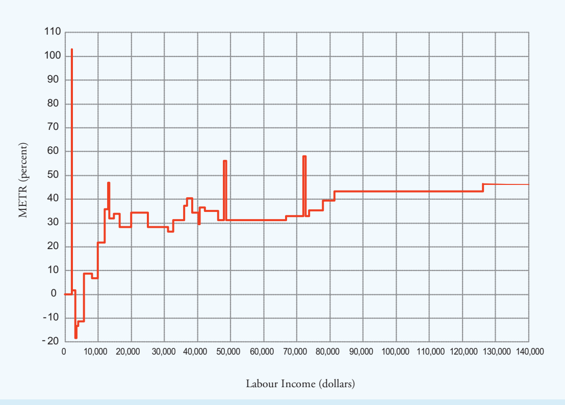
Figure 1: Marginal Effective Tax Rates for a Single Individual in Ontario, 2009